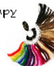
Streaks & Bangs

Colour and Sound vibrations travel deeply into the body along the energy pathways within the body. Use a colour lamp or tuning forks for yourself, staff or a client.